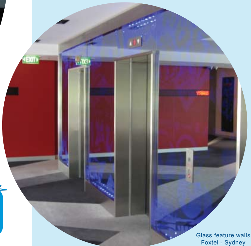
Glass feature walls Foxtel - Sydney

To make it easy to specify EnduroShield™ for your next project, a two page specification on each product is available to download at: www.enduroshield.com/specifications